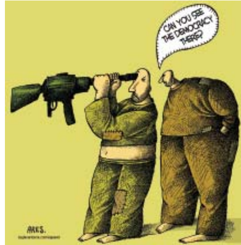
Seeing the democracy